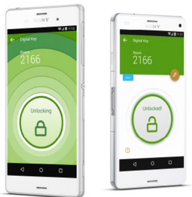
Hilton HHonors - 1.2 M Downloads